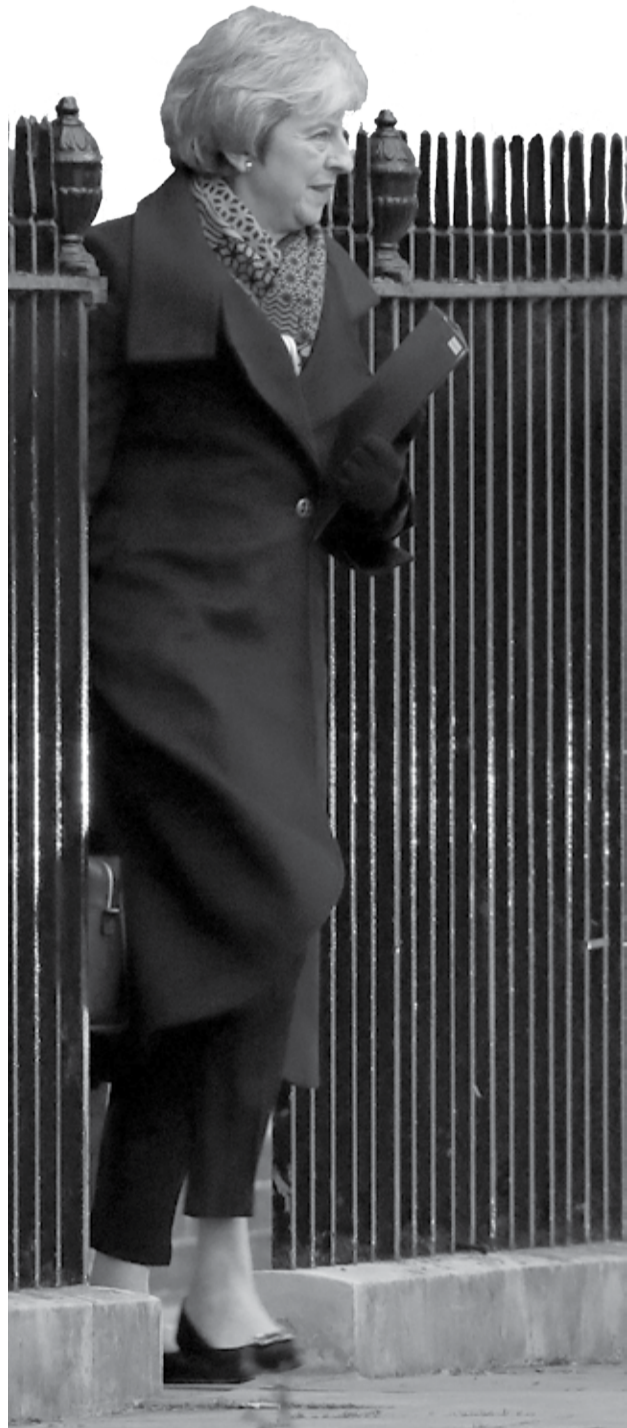
Britain's Prime Minister Theresa May leaves from the rear of 10 Downing Street with Number 10 Chief of Staff Gavin Barwell,

The EU and European governments have warned that the British parliament's rejection of a Brexit deal heightens the risk of a disorderly withdrawal from the bloc. Following are some of the key reactions to Tuesday night's huge defeat for British Prime Minister Theresa May.