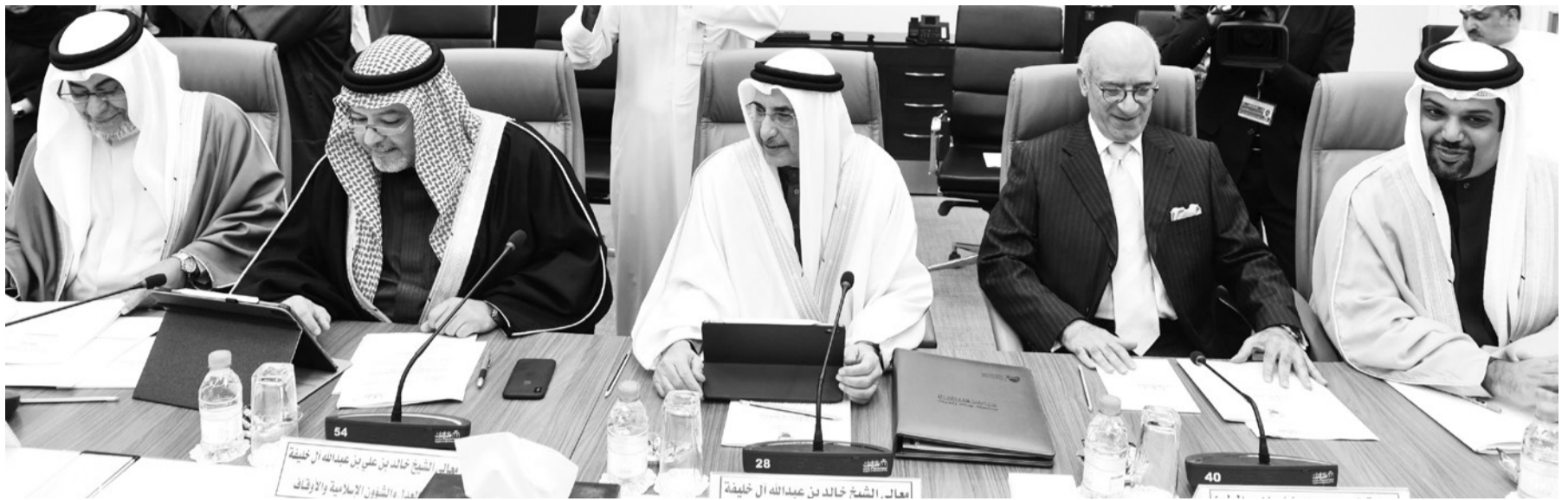
Deputy Premier Shaikh Khalid with other ministers at the meeting.

She commended the cooperation of the Government's delegation, led by Deputy Premier Shaikh Khalid bin Abdulla Al Khalifa, as well as readiness to provide all queries regarding the