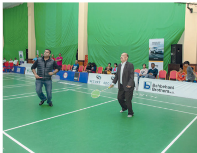
Event organisers in action during inauguration

The tournament has Boys & Girls - Singles & Doubles in the age category of U11, U13, U15, U17, U19 and for seniors 4 events - Men's Doubles, Women's