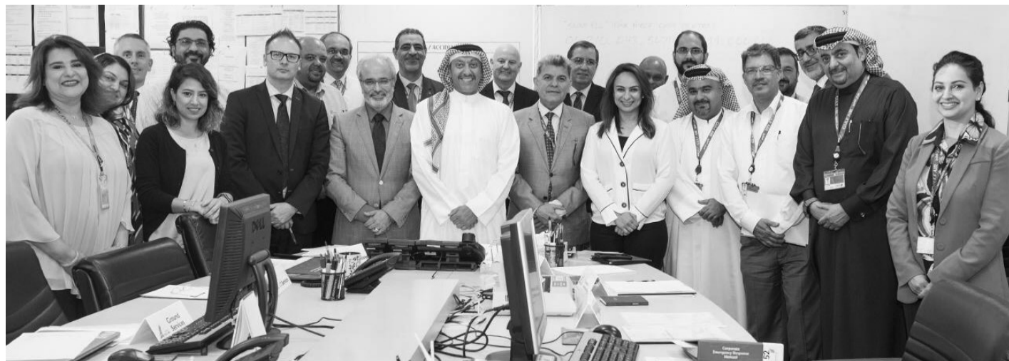
Gulf Air officials during an emergency response exercise at the airline's headquarters last week held to ensure the preparedness level to handle emergency in a timely, effective and responsible manner. The exercise, a refresher training to Gulf Air's Emergency Response Team assessed the adequacy of plans and procedures in the event of an emergency aimed at improving emergency preparedness level. The event was coordinated by the airline's Emergency Response Planning unit within the Security department in Gulf Air's Emergency Management Centre.