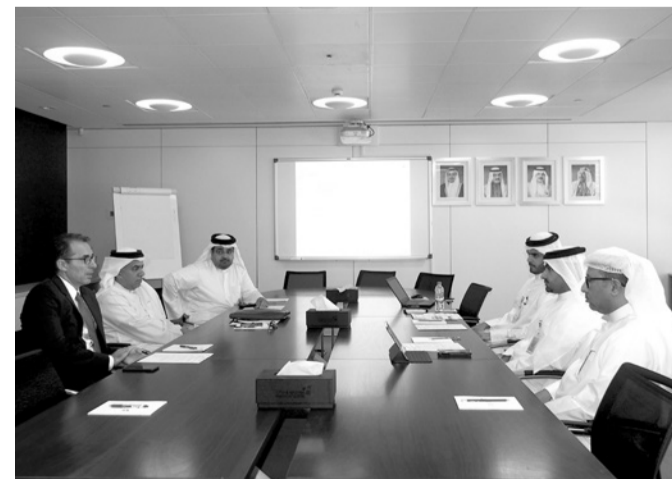
The Telecommunications Regulatory Authority's (TRA) Board of Directors during their last meeting of 2018 at TRA's headquarters in the Seef District. Board members discussed key issues related to the telecommunications sector praising TRA's outstanding efforts in the development and growth of the telecommunications sector in the Kingdom of Bahrain.