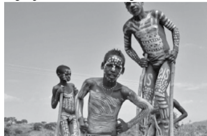
Representative picture

The team behind the study believe that the stripes disrupt the polarisation of light reflect-