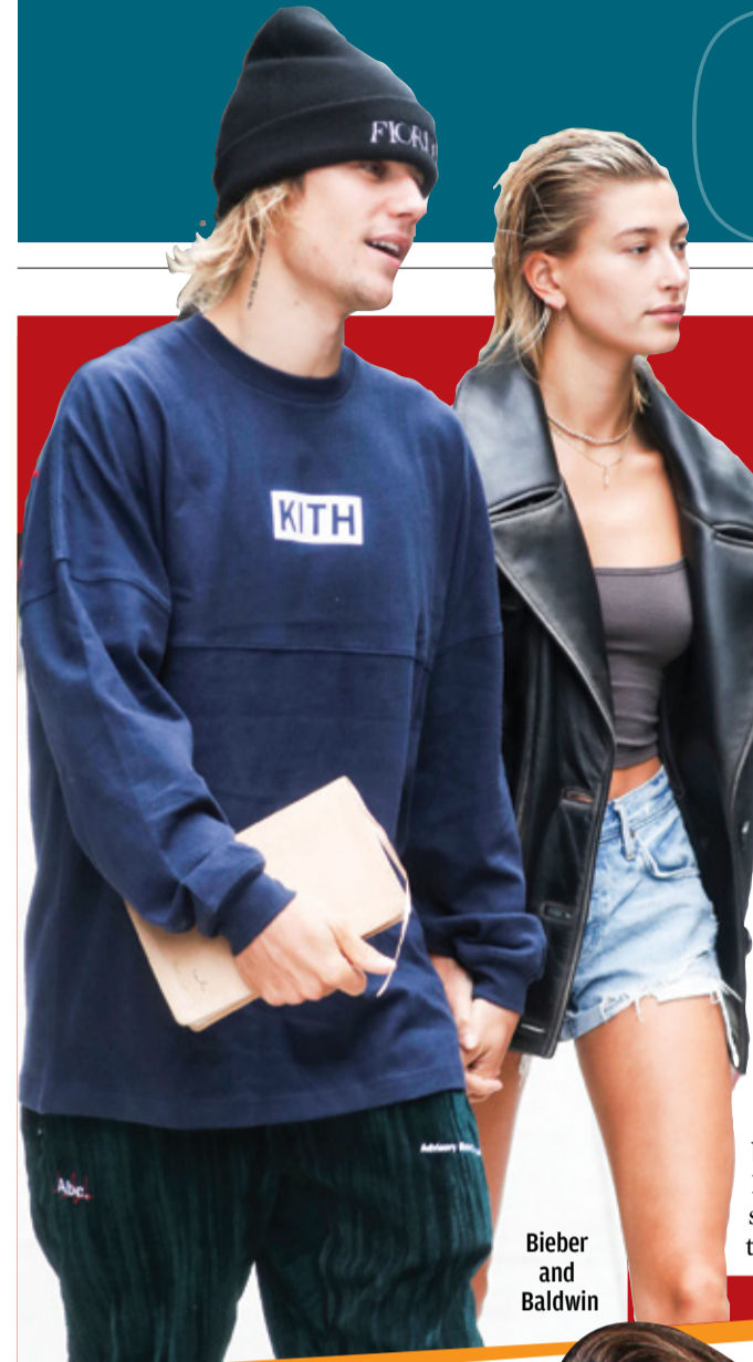
Bieber and Baldwin

Pop star Justin Bieber's mother raved over her son's new wife Hailey Baldwin in an adorable selfie. On Tuesday, Bieber's mother Pattie Mallette shared a sweet selfie of herself with Baldwin, 21. "What a gift!" Mallette, 43, wrote adding a heart-eyed emoji. In the shot, Baldwin can be seen planting a kiss on Mallette's cheek "Love you," Baldwin, who secretly married Bieber, 24, at a New York City courthouse in September, commented on the post. Earlier on Tuesday, the newlyweds were spotted in Los Angeles wearing matching pink ensembles. Bieber sported a pink hoodie paired with black sweatpants and Vans. Meanwhile, Baldwin rocked a pink tracksuit, white sneakers and pulled her newly dyed pink tresses into a sleek bun.