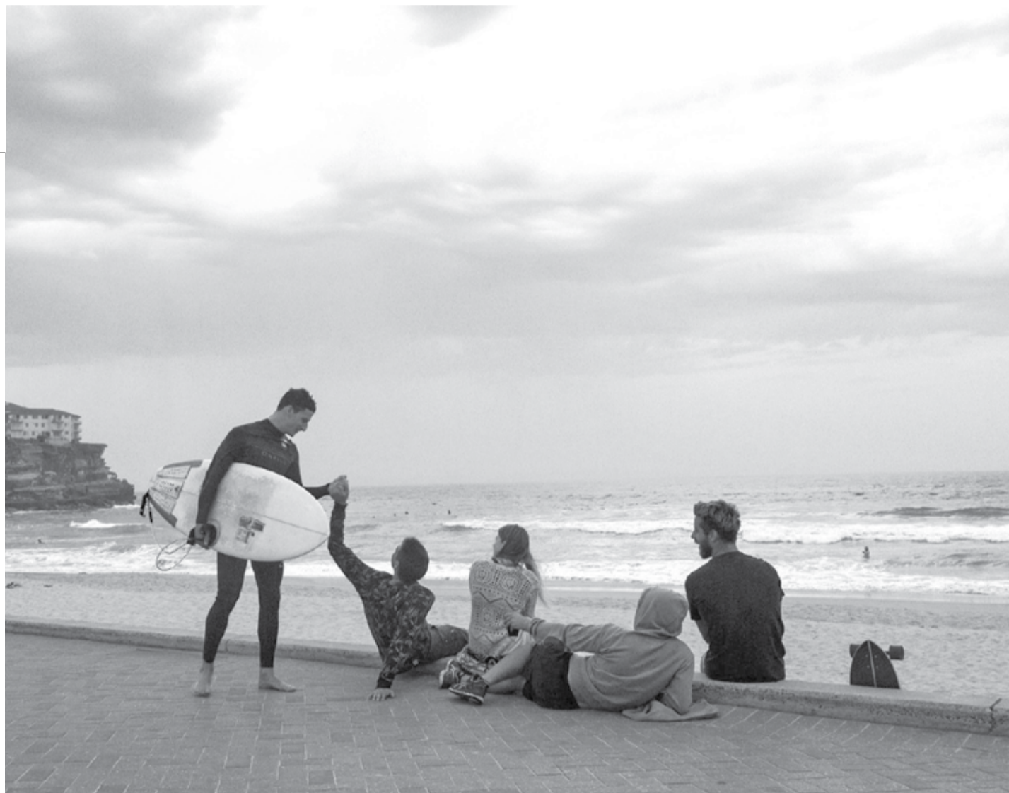
Sunset approaching at Manly Beach, near Sydney, Australia.

I haven’t had a hangout like that since college. Here, that