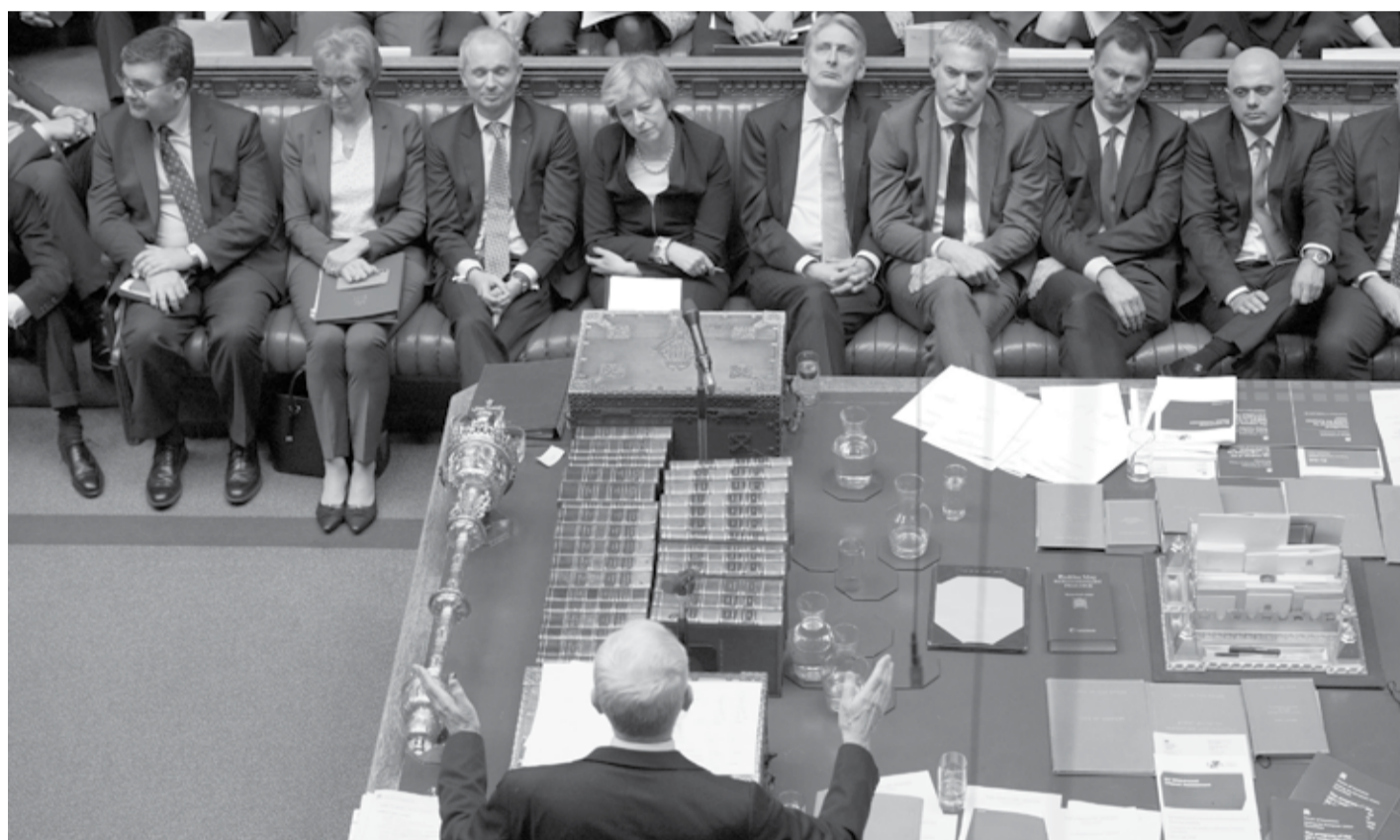
Britain's main opposition Labour Party leader Jeremy Corbyn (C bottom) giving his response and informing the House that he has tabled a motion of no confidence in the Government in the House of Commons in London