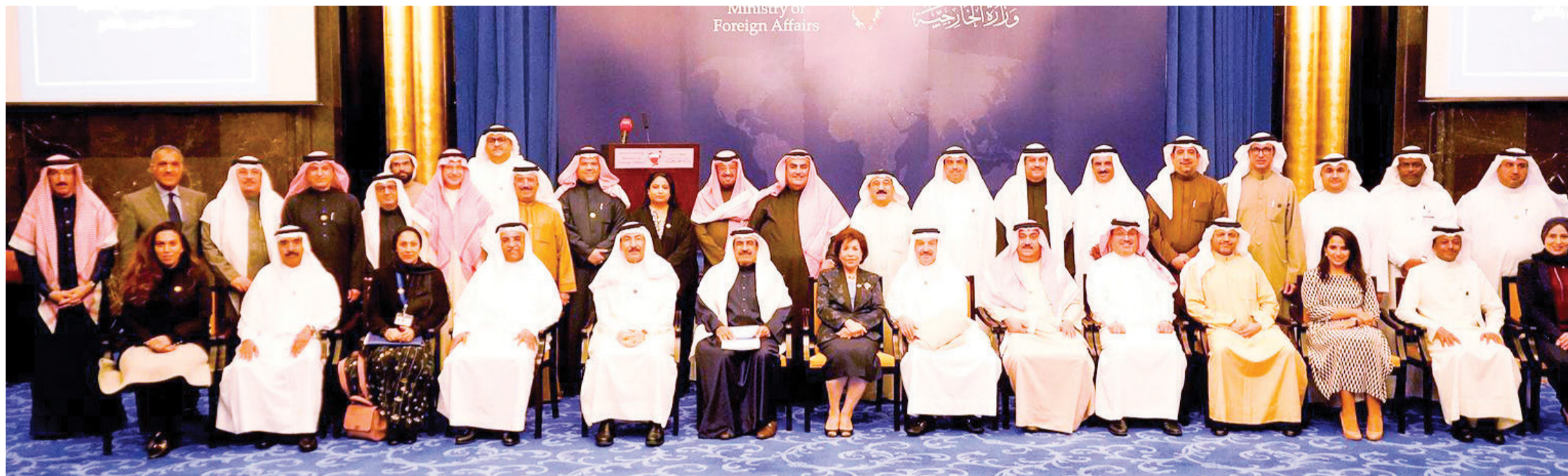
Shaikh Khalid with Foreign Ministry officials and diplomats at the forum.