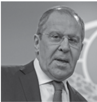
Lavrov attends a meeting with his Japanese counterpart in Moscow

"Japan votes not with us but against us on all the resolutions that interest Russia in the