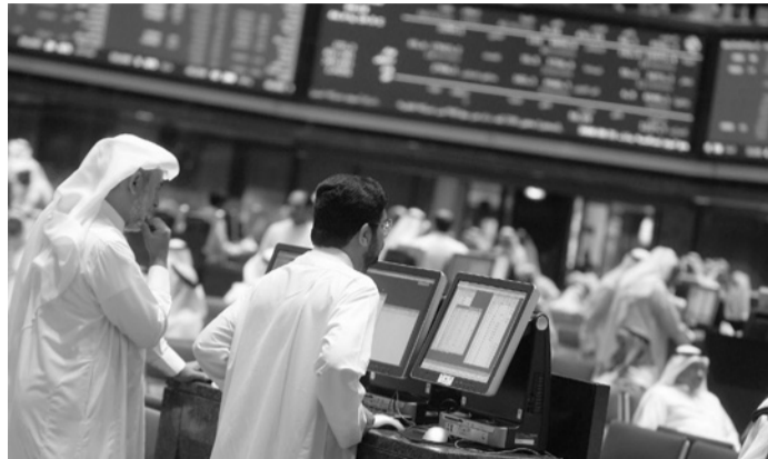
Saudi stock market.jpg

Most cement stocks also gained with Tabuk Cement increasing 4.8pc after saying that it had exported 6,950 tonnes of cement to Yemen under a memorandum of understanding with International Tataloat Co.