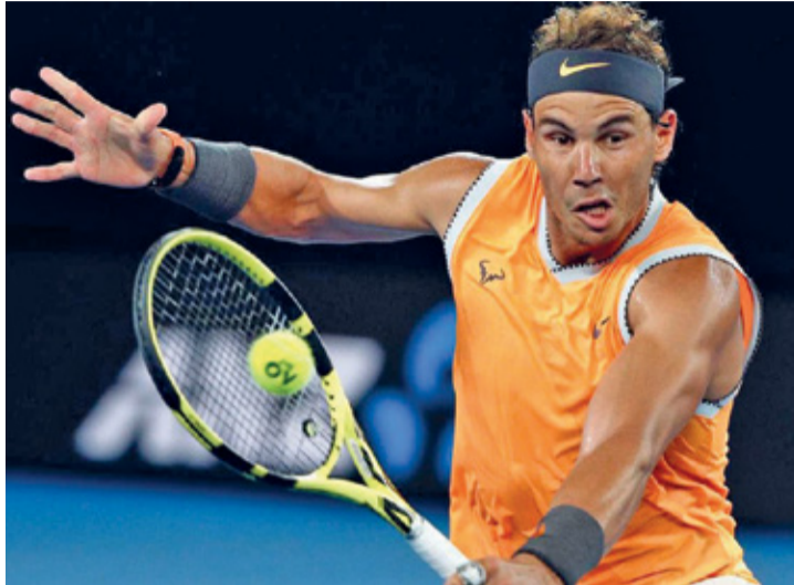
Spain's Rafael Nadal hits a return against Australia's Matthew Ebden

Ninth seed Kiki Bertens, who raced through the rankings last