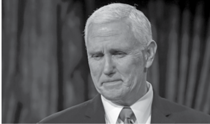
US Vice President Mike Pence

Despite the pledge of support, Pence double-downed on President Donald Trump's