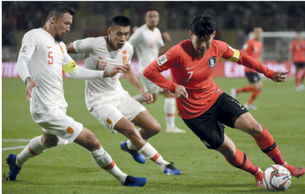
China's defender Linpeng Zhang (L) fights for the ball with South Korea's forward Heung-min Son

Korean captain Son surprisingly started -- and completed 87 minutes -- despite a punishing run of 13 games for Tottenham since the start of December.