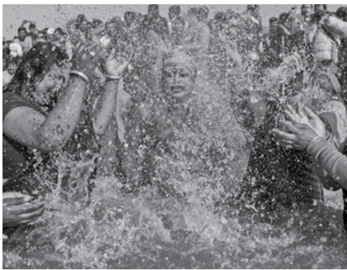
Followers of the Kinnar Akhara monastic Hindu order made up of transgender members take a dip in the Sangam

Adityanath, who hails from Prime Minister Narendra Modi's Bharatiya Janata Party,