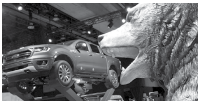
A bear display is seen in front of a Ford truck during day one of the 2019 North American International Auto Show

Ford is aiming to post better financial results this year than last, but warned that Brexit, tariffs, currency fluctuations, salary negotiations and the health of the Chinese and European economies will have an impact.