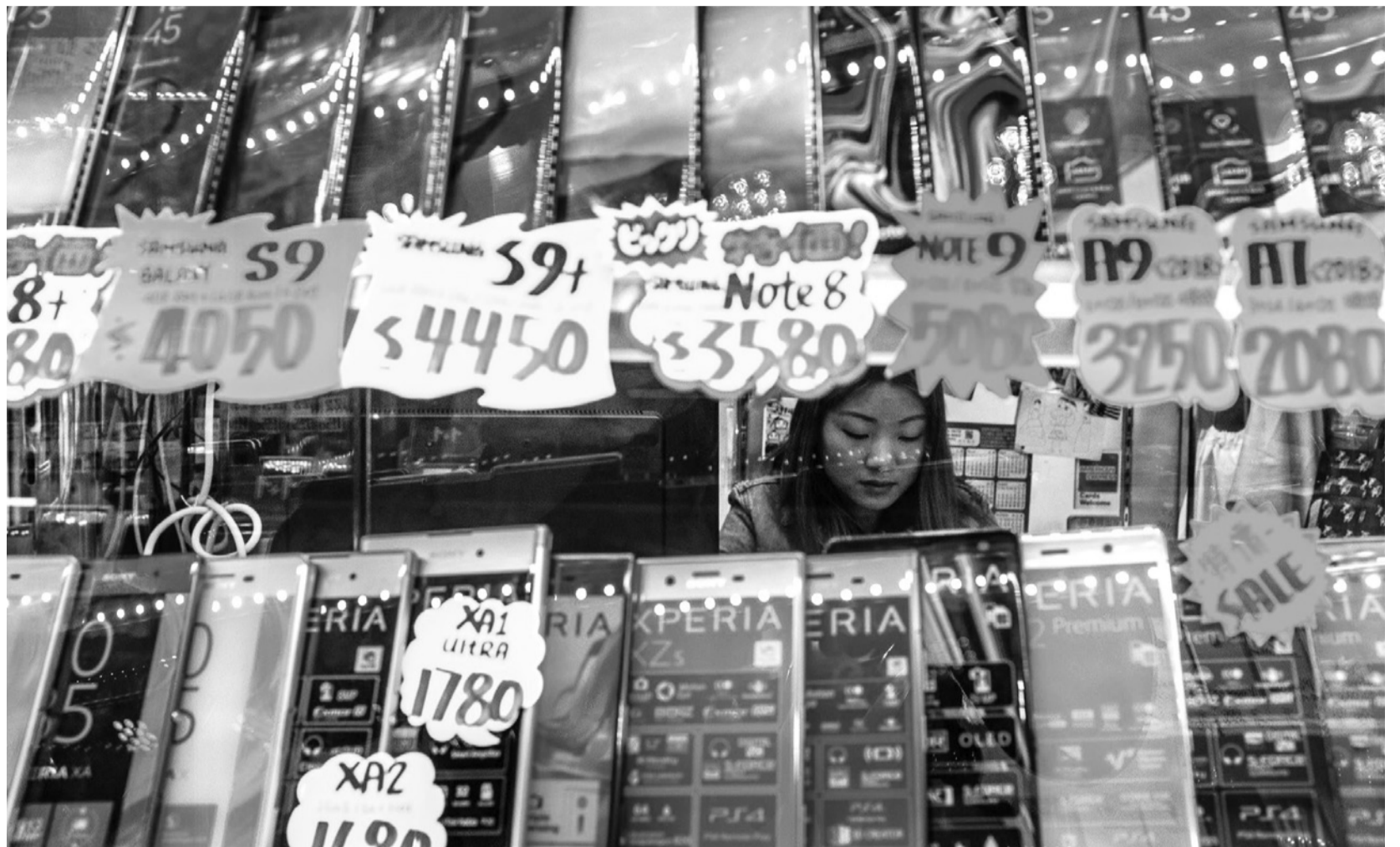
A mobile phone shop in Sin Tat Plaza, in Hong Kong.

Apple's declining sales reveal how important the health of China's consumer market is to the world's economy