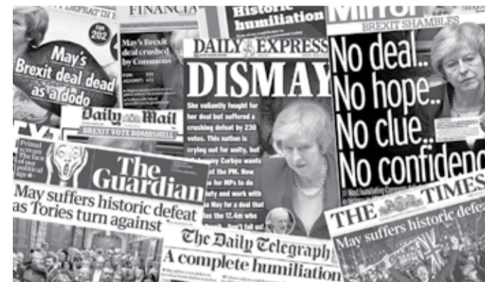
London, United Kingdom