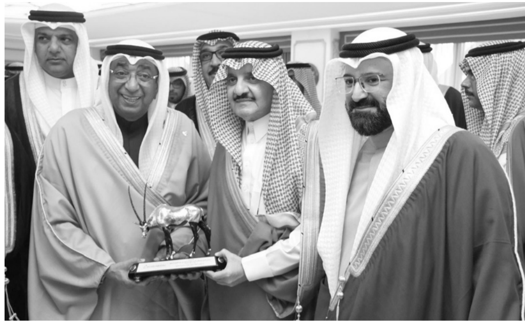
A delegation from the Bahrain Chamber of Commerce and Industry (BCCI) spearheaded by chairman of the board of directors Sameer Nass meeting yesterday the Emir of the Eastern Province of Saudi Arabia Prince Saud bin Nayef bin Abdulaziz Al Saud. Nass hailed the historic and deep-rooted relation between Bahrain and Saudi Arabia, and mulled stepping-up economic cooperation and integration.

Qatar's index also traded flat, with Middle East's biggest lender, Qatar National Bank, shedding 0.5pc despite reporting a increase in full-year net profit and total customer deposits.