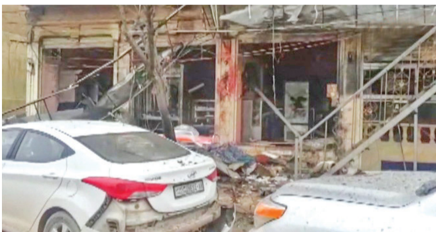
The aftermath of a suicide attack in the northern Syrian town of Manbij.

A US official who declined to be named said four US troops had been killed and three wounded in the blast, which a Daesh-affiliated site said was the work of a suicide bomber. Others said only two had been killed.