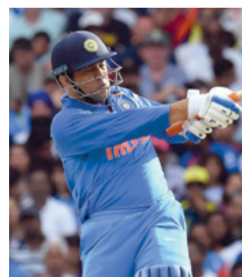
India's Mahendra Singh Dhoni plays a shot (file photo)

Some observers have suggested India have better options behind the stumps and with the bat for upcoming ODI World Cup in England, but former skipper