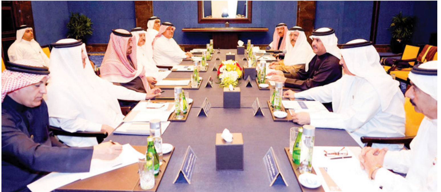
Many discussions on the Kingdom's foreign policy were held as part of the forum.

ment unnecessary. He noted that the Kingdom of Bahrain and the friendly United Kingdom celebrated two years ago the 200th anniversary of Bahrain-UK relations, which was established at that time to achieve common interests.