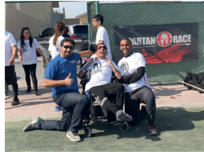
KHK Heroes during a Spartan Race Manama

Spartan Arabia will host the first-ever Stadion of the region on January 18, 2019, under the patronage of HH Shaikh Nasser Bin Hamad Al Khalifa. The Bahrain National Stadium will see Spartans take on obstacles at this unique location, for a one of a kind experience.