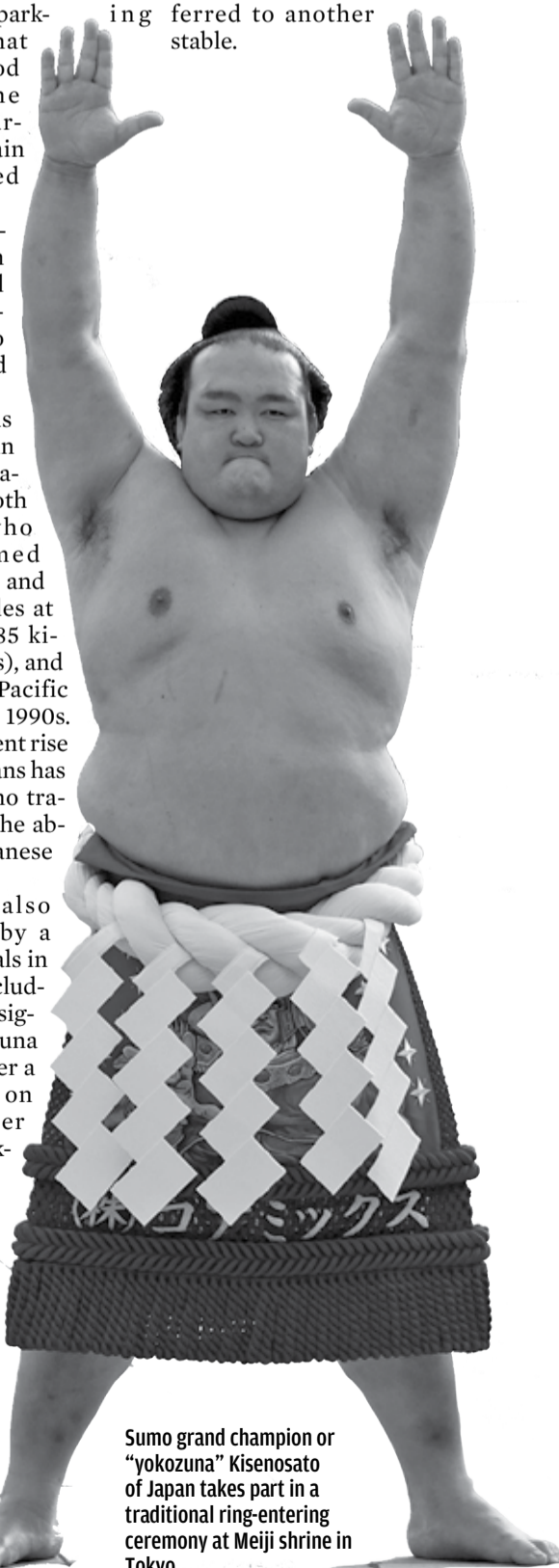
Sumo grand champion or "yokozuna" Kisenosato of Japan takes part in a traditional ring-entering ceremony at Meiji shrine in Tokyo

The decision meant his wrestlers and staff were transferred to another stable.