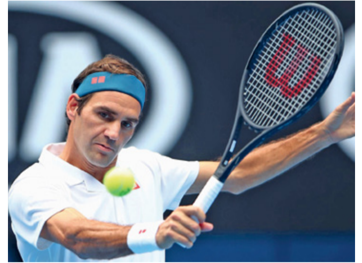
Switzerland's Roger Federer hits a return against Britain's Daniel Evans