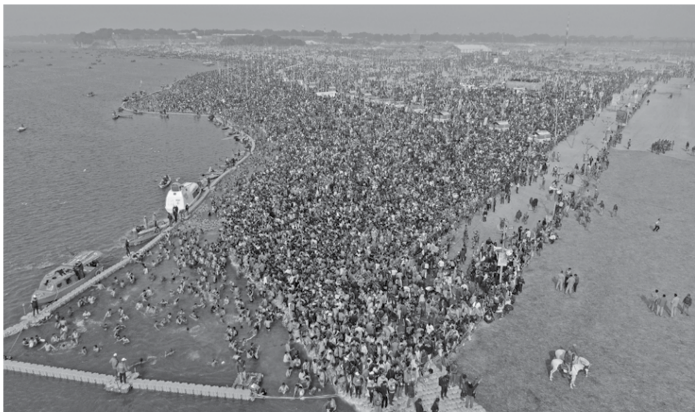
Indian Hindu devotees taking a holy dip at Sangam -- the confluence of the Ganges, Yamuna and mythical Saraswati rivers